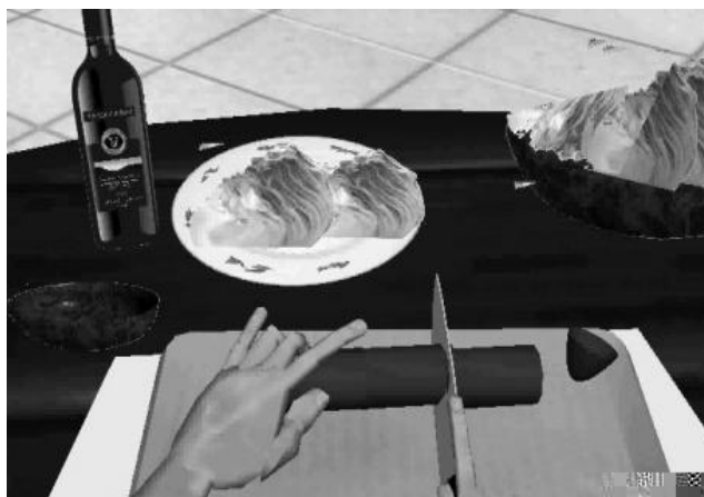
Figure 1: Snapshot taken from simulated environment at the point where the avatar paused.

Materials and Design. The experimental stimuli consisted of a movie involving a human and a parallel simulation involving an avatar to accompany our two between-subjects conditions: human enacting actions and avatar enacting actions (see Figure 1).